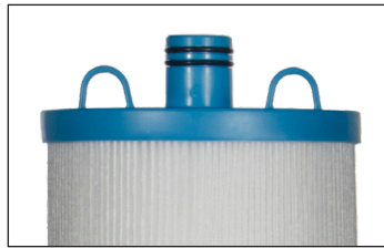
Dual O-rings in upright position for Clack Cartridge Tank.