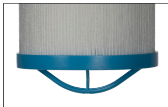
Opposite end of filter.

Clack Cartridge Tank Pleated Sediment Filters deliver high-performance filtration with a flexible design that adapts to a variety of systems.