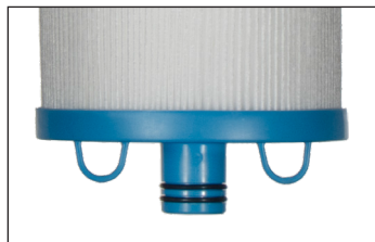
Dual O-rings in the downward position for other cartridge tanks on the market.