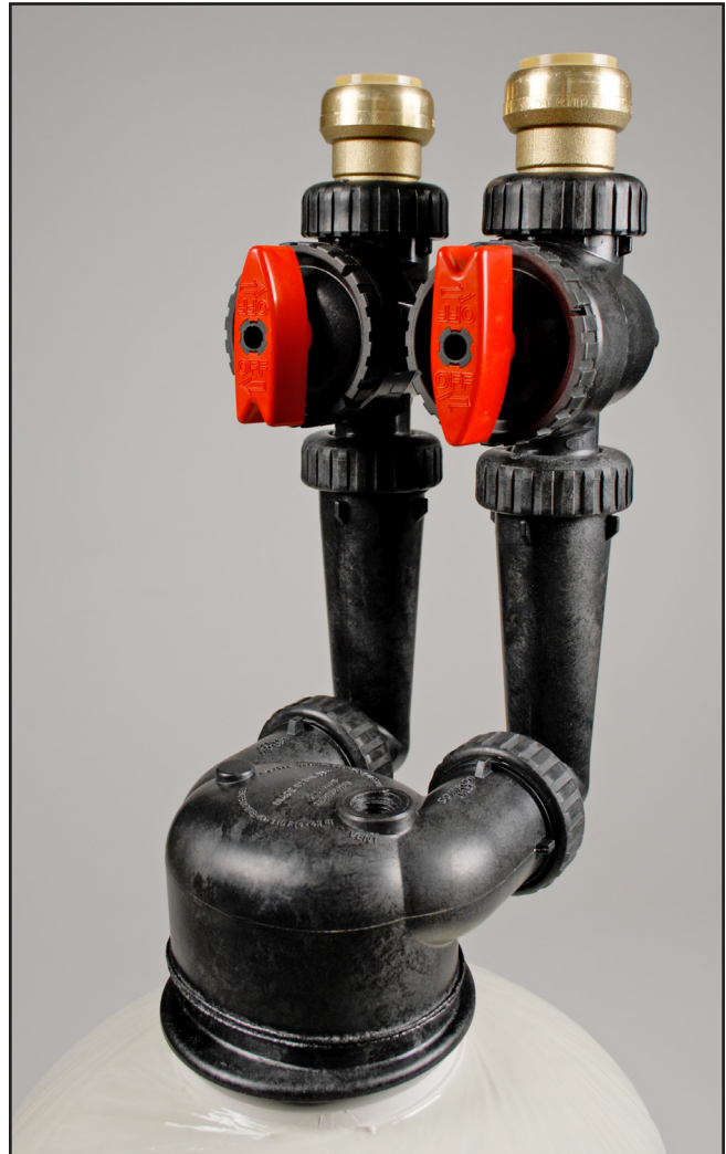
1191 In-Out Head shown with optional V3191-01 Vertical 90° Adapter Kit, V3006 Bypass Assembly and V3007-13 1" SharkBite® Fittings

Note: On upflow service the bypass will give two-way function capabilities (service and bypass). The red bypass handles also need to be reversed to indicate proper service flow direction.